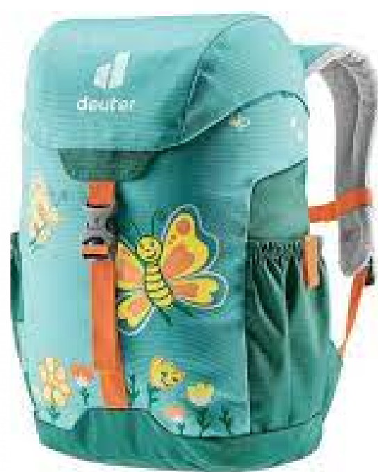
A book bag or a rucksack