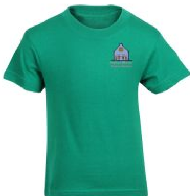
A PE kit with my housecolour t-shirt