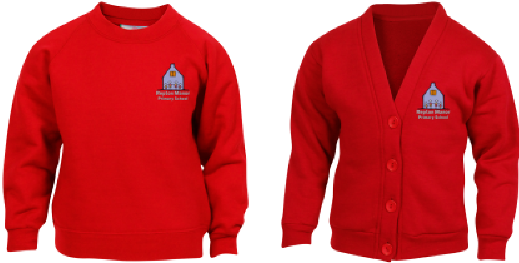
A red jumper or cardigan