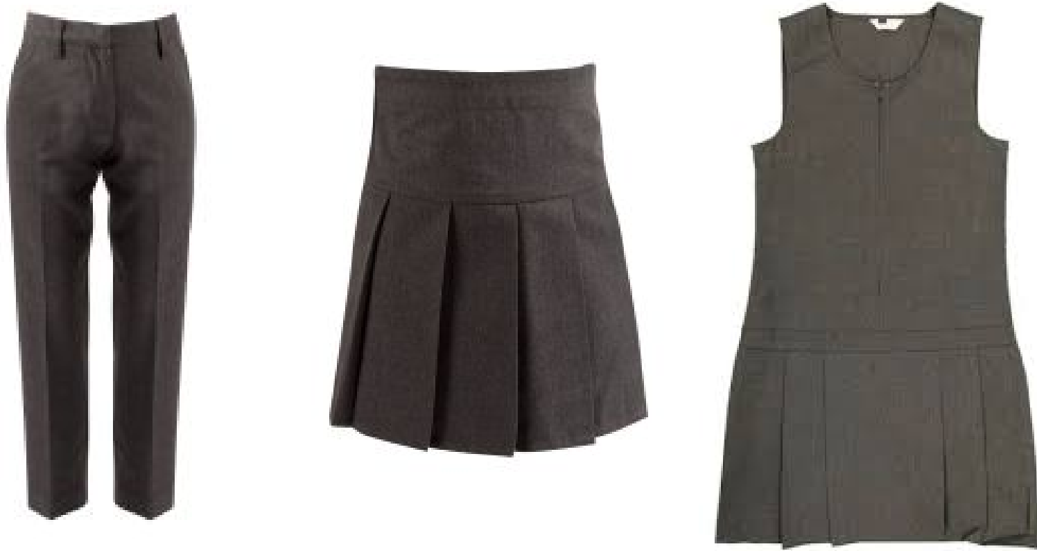
A grey skirt, dress or pair of trousers