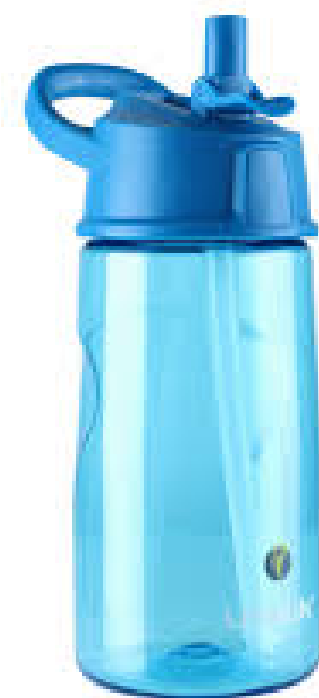
A water bottle