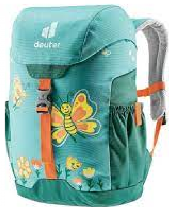
A book bag or a rucksack