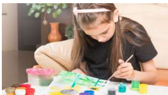
Sitting at a Table