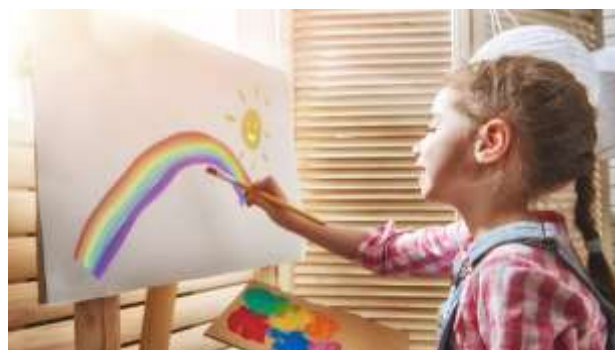
Standing at Vertical Surface