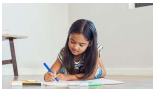
Lying on Tummy and Propped on Elbows